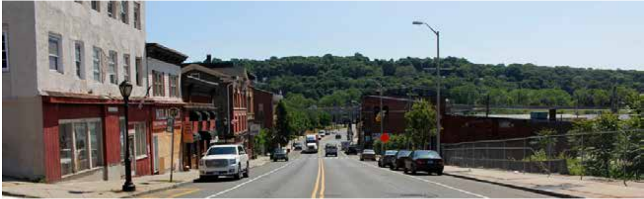
Rt 34 Derby Downtown

Route 34 is a primary artery through much of the lower valley and operates as a key connection between the downtowns of Shelton and Derby. Route 34 also serves as the 'Main Street' for Derby and high traffic volumes, congestion and alignment pose several concerns. The reconstruction and major widening of Route 34 through downtown Derby was initiated several years ago- to combat congestion and improve safety for both motorists and pedestrians along this stretch of road, A critical element of the project is the understanding that, as the City's 'Main Street,' the design needs to remain cognizant of the dual purposes of addressing traffic operations and facilitating and encouraging pedestrian movement and bicycle use. The NVCOG administers the design of the project and serves as the liaison between the City, CTDOT and designer. During the year, the NVCOG met with the City and the state to ensure the project includes elements to support these multi-modal uses, restricts the speeds of traffic and deploys infrastructure appropriate for a downtown main street.