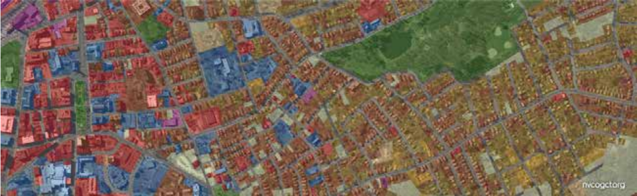
NVCOG Land Use Mapping

The NVCOG operates to serve the needs of the communities that it represents. This strongly relates to supporting regional cooperation and acting as council to the communities, including focus on land use issues. This facet relates to the review of proposed amendments and changes to local zoning regulations and proposed development of land within 500 feet of a municipal border. The focus of the review is on how the proposed changes may result in implications for and affect adjacent and surrounding communities. The NVCOG, through its Regional Planning Commission (RPC), supports and provides guidance to the communities in the establishment and revision of mandated planning documents to aid in articulating a message that reflects each community’s needs and concerns.