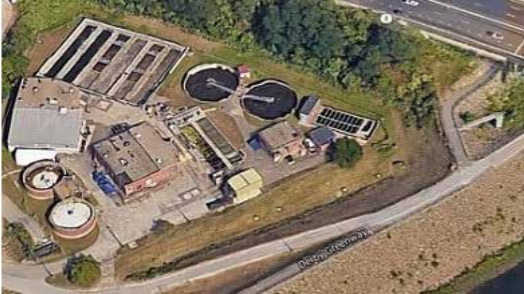
Derby Water Pollution Control Facility

Shared service programs for Information Technology (IT), regional parcel mapping and revaluation are scheduled to be introduced in early FY '17. In addition, NVCOG staff are collaborating with other Connecticut councils of government in preparing regional programming to help municipalities comply with new federal MS4 permitting standards