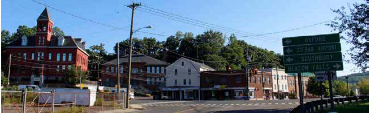
Rt 67 Seymour

The Preliminary Engineering study is assessing the need for and feasibility of implementing various spot improvements along Route 67 from the intersection of Route 67 and Franklin Street, to just west of the intersection with Swan Avenue. The study, and the subsequent recommended improvements are designed to address heavy congestion and safety concerns through this corridor.