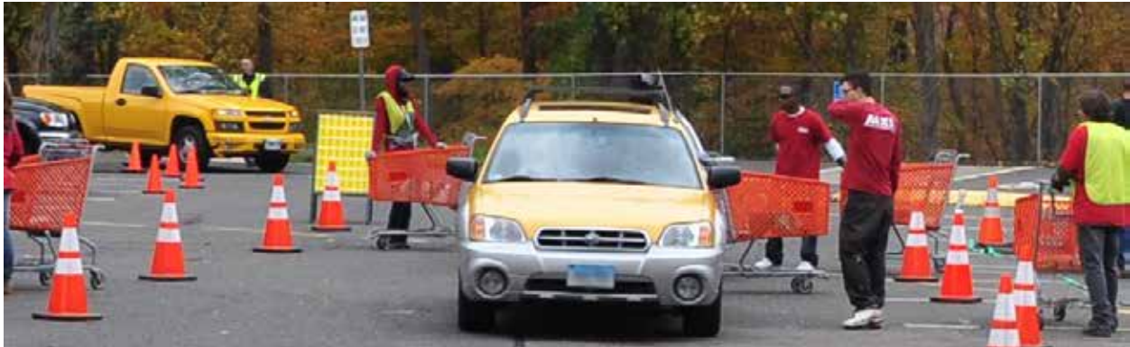
Household Hazardous Waste Collection

Sharing services and purchasing among municipalities were identified as priorities in NVCOG's formation. Reducing costs and increasing efficiencies for programs are often the primary benefits of such programming. The former Council of Governments Central Naugatuck Valley has administered a regional household hazardous waste program for many years, the merged NVCOG continues the efforts of this program. The program exists to facilitate the proper disposal of hazardous materials through providing communities with the appropriate disposal channels.