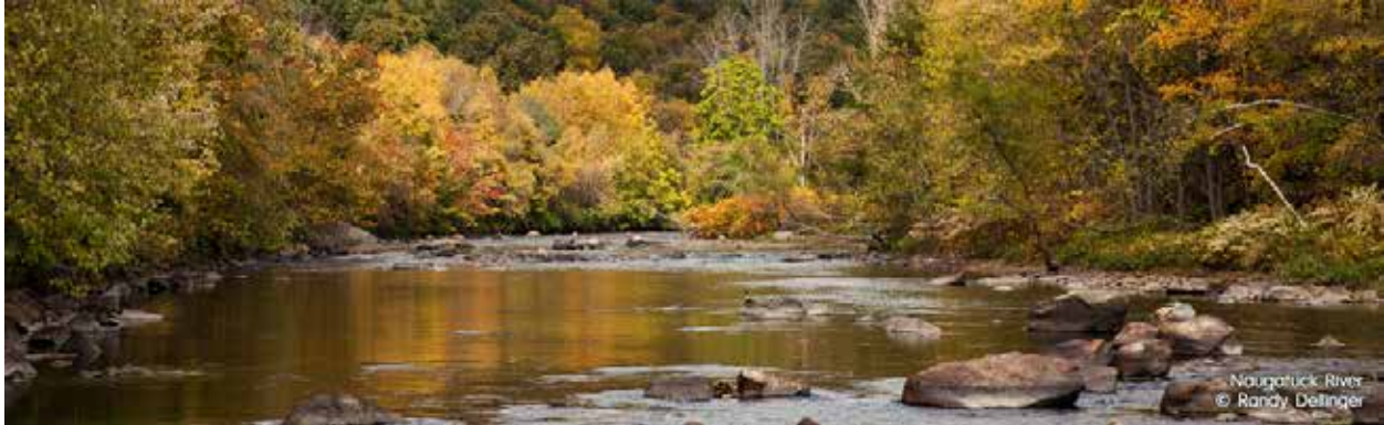
The Naugatuck River

The NVCOG provides administrative support to the Naugatuck River Greenway Steering Committee (NRGSC). The mission of the NRGSC is to help coordinate the planning and construction of the NRG. The committee is comprised of representatives from all 11 communities along the planned route, plus federal, state and regional agencies, nonprofit and community organizations, and other stakeholders. The National Park Service awarded the NRGSC with a Conservation Hero award in 2016 for work done to help reclaim the Naugatuck River for recreation, a great honor! More information can be found through clicking HERE .