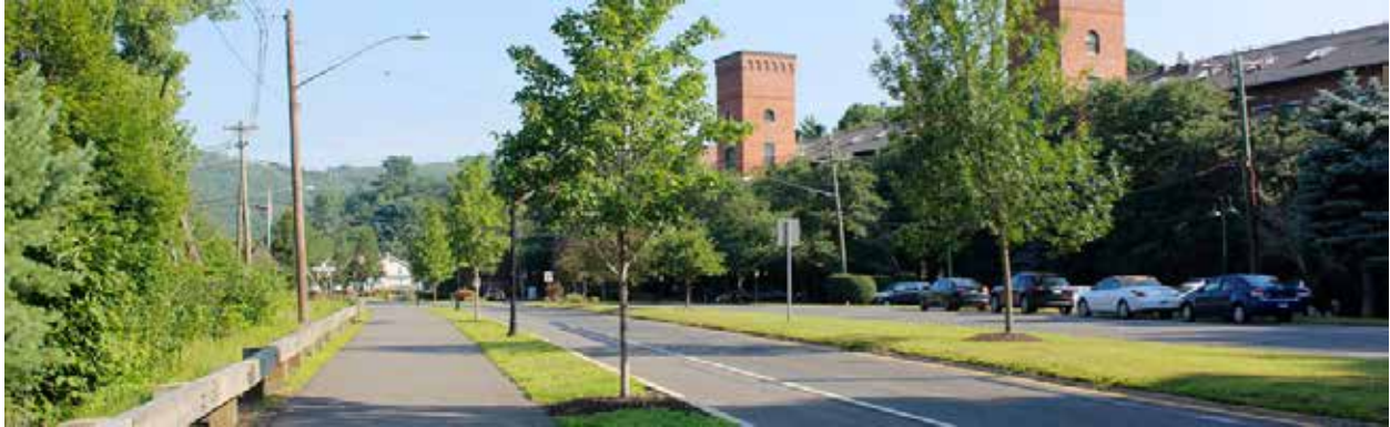
Beacon Falls Downtown

The NVCOG completed a guide on transit oriented development (TOD) that focused on rail stations areas of the four former Valley Council of Governments municipalities. The document explores many of the land use and financial tools available to municipal governments to encourage development that is complementary to and supportive of expanded public transportation services. It focuses on those neighborhoods most favorable to TOD along the Waterbury Branch Line (WBL), examines existing zoning regulations, catalogues many of the existing zoning tools that are being used across Connecticut, as well as across the nation, identifies financial tools that could be used to promote future growth, and provides a model TOD overlay zone appropriate for adoption by the municipalities along the WBL.